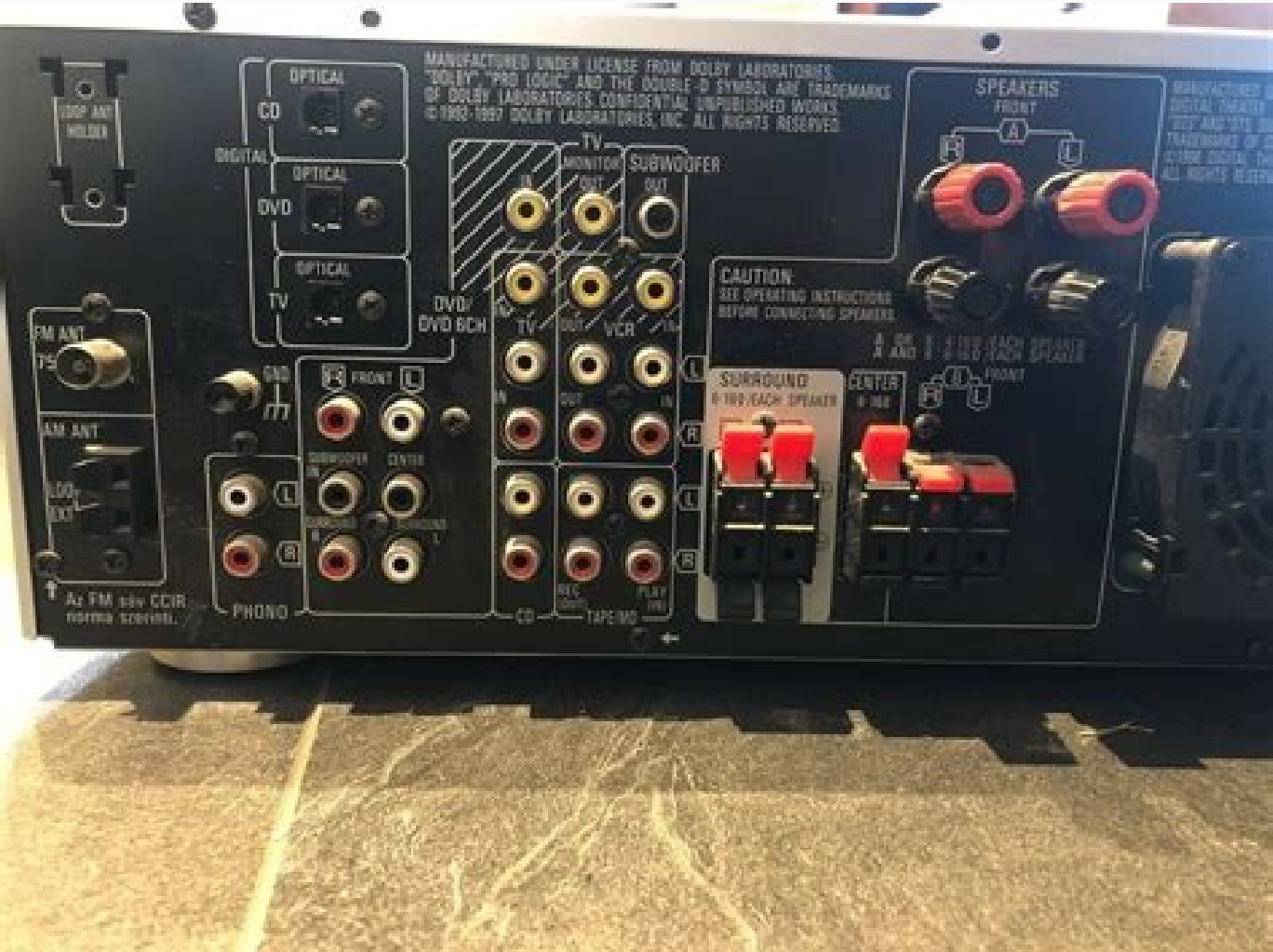
Technics sa- dx940 overload problem. Technics sa dx940 overload message.